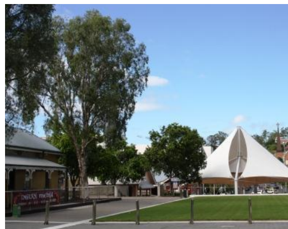
View of d'Arcy Doyle Place from Brisbane Street

Need help? Please call the Ipswich Art Gallery on 07 3810 7222.