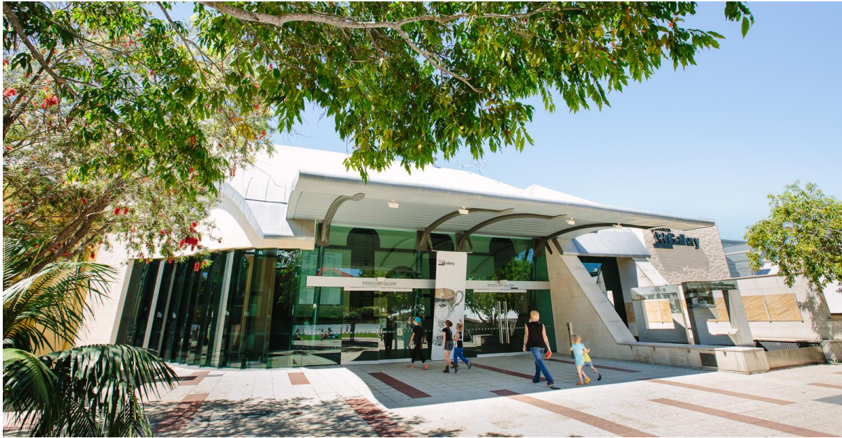
Gallery Entrance d'Arcy Doyle Place