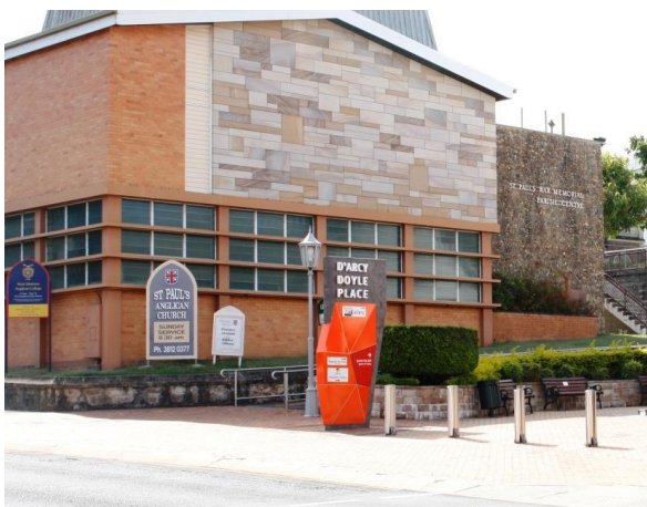
View of d'Arcy Doyle Place from Limestone Street